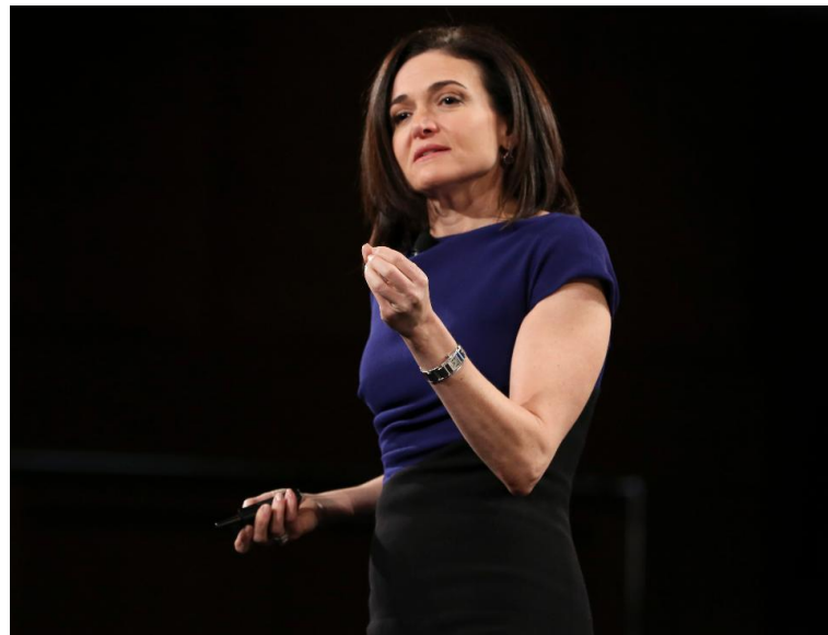
Facebook COO Sheryl Sandberg gave a personal, heart-wrenching speech to UC Berkeley students.

This week college graduates at campuses around the nation listened to words of wisdom and advice from a host of inspiring speakers. In a personal, heart-wrenching speech at UC Berkeley, Facebook's FB -0.38% Chief Operating Officer Sheryl Sandberg offered lessons in gratitude and resilience in overcoming loss a year after the sudden death of her husband, Dave.